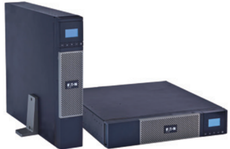
2U rackmount/tower: 1440–3000 VA