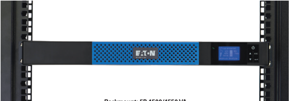
Rackmount: 5P 1500/1550 VA