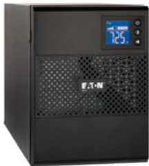
500–1500 VA tower with LCD