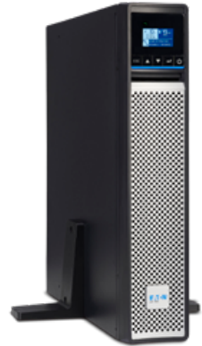
Tower: 1000–3000 VA