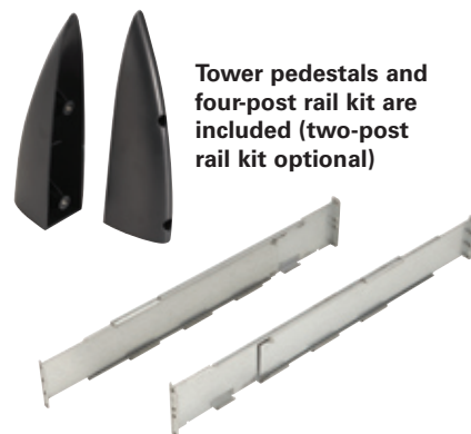
Tower pedestals and four-post rail kit are included (two-post rail kit optional)