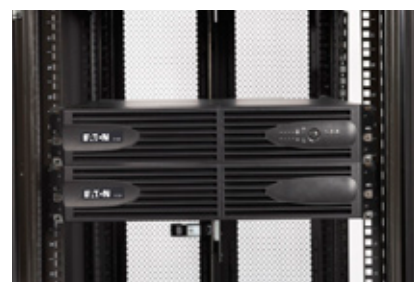
2U rackmount model with 2U EBM—add up to four EBMs for hours of runtime