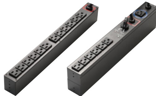
Optional FlexPDU and HotSwap MBP for greater flexibility and uptime